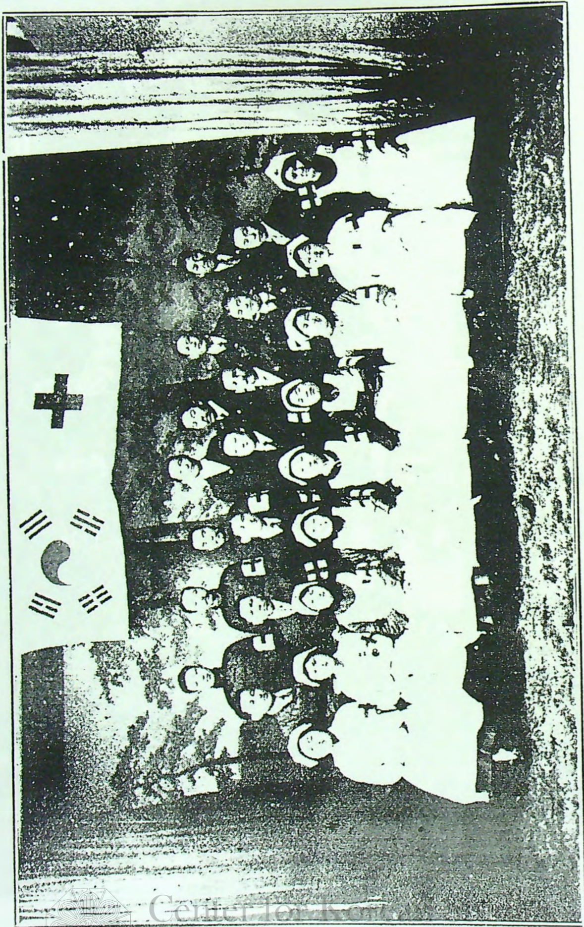
The Aid Class of 1919.